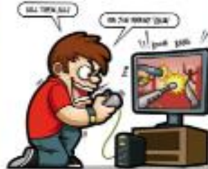
A Parent's Guide to Gaming