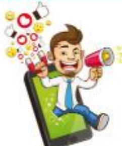
A Parent's Guide to Live Streaming