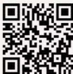
scan the QR code with your phone's camera to see the guides on our website